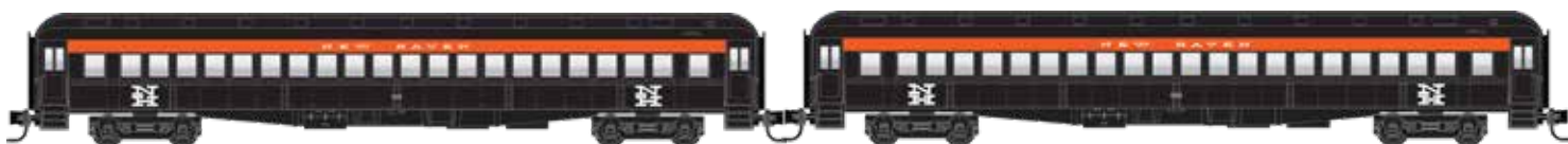
SINGLE WINDOW COACH