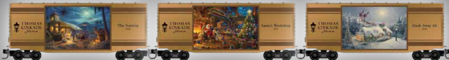
The Nativity - 2016 #101 00 831...$27.95