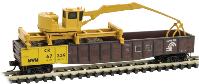
NOTE: CONRAIL GONDOLA SHOWN FOR REPRESENTATION

NOTE: TEST PAINT ON PART OF THE SCRAP SPRUE OR BOTTOM SURFACE OF PARTS FIRST!