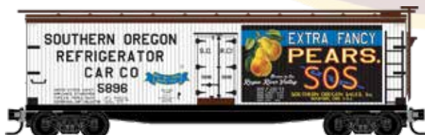
MT&L RR 40' Wood Reefer #049 50 940...$28.95