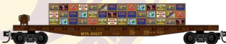
MT&L RR 50' Flat Car #045 50 490...$27.95