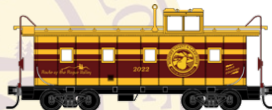
MT&L RR 36' Caboose #100 50 570...$31.95