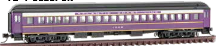
SINGLE WINDOW COACH