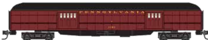
BAGGAGE CAR (x5)