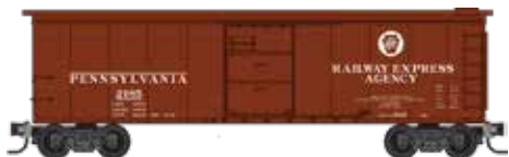
40' BOX CAR (x1)