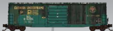
SEABOARD AIR LINE®