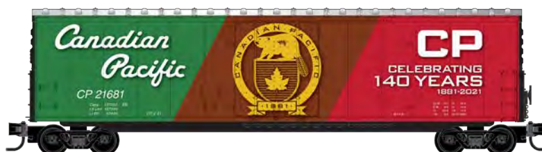
50' Standard Box Car

N Canadian Pacific #181 00 160...$27.95 COMING JULY 2021