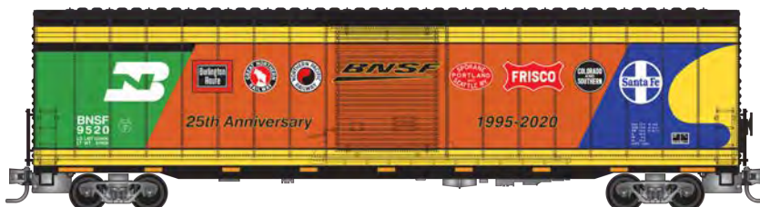
60' Excess Height Box Car

N BNSF #104 00 080...$27.95 COMING AUGUST 2021