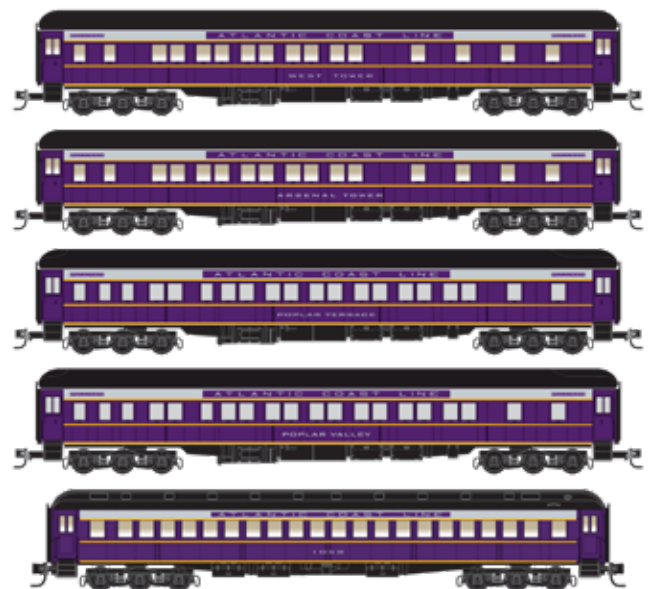
ACL Heavyweight 5-pack #993 02 080...$149.95 Estimate mid-February