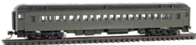
78' Heavyweight Paired-Window Coach Car Painted Dk. Pullman Green #145 00 001...$21.25

*All undecorated bodystyles come unassembled.