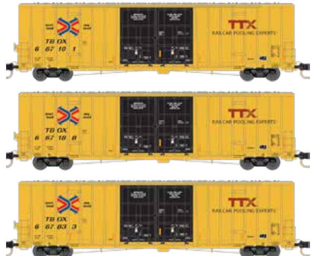
TTX v.2 3-pack #993 01 850...$119.95 Estimate mid-March