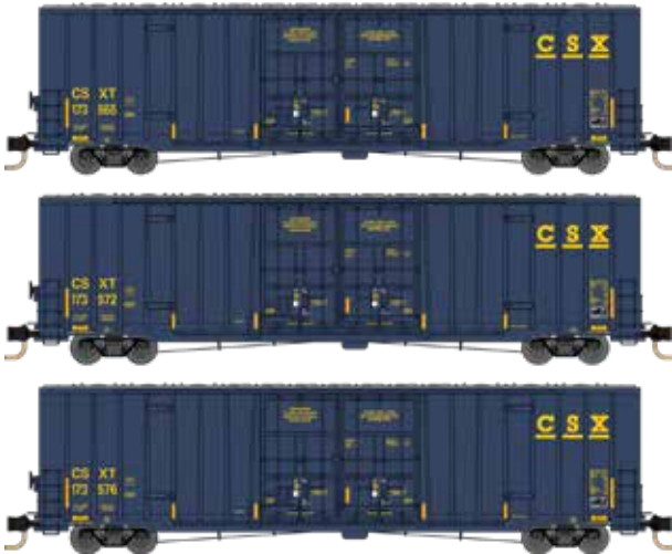
CSX® #993 01 860...$119.95 Estimate mid-February