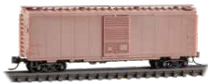
40' Standard Box Car, Single Door #020 00 000...$14.70