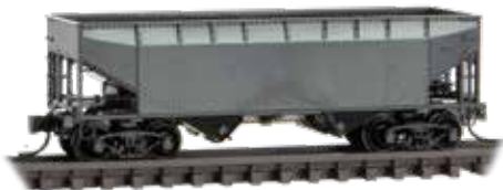
33' Twin Bay Hopper, Offset Sides #055 00 000...$17.90