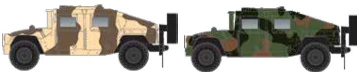
Desert Camo Humvee® Vehicle 2-pack #499 45 953...$34.95