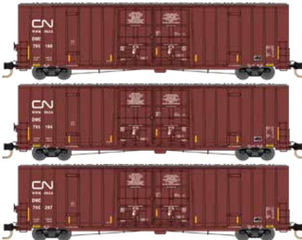
Canadian National #993 01 870...$119.95 Estimate mid-April