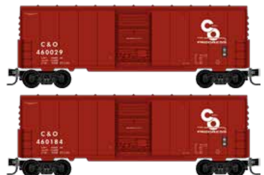
Z C&O® 40' Standard Box Cars #503 00 221 #503 00 222 CANCELLED