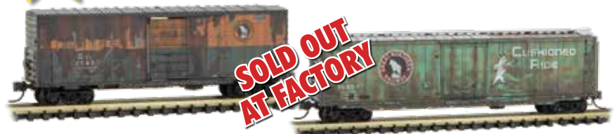
N Great Northern 2-pack #993 05 760...$59.95