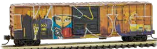
N Railbox Series #10 'National Mischief Night' #025 45 014...$29.95