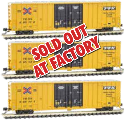
TTX v.1 3-pack #993 01 840...$119.95 Estimate mid-November