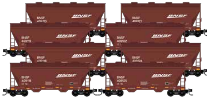
BNSF 2-Bay Hopper 8-pack #993 00 819...$219.95 Estimate mid-December