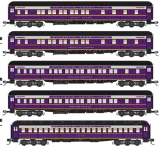
ACL Heavyweight 5-pack #993 02 080...$149.95 Estimate mid-January