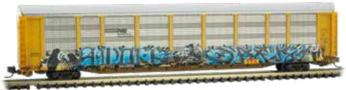
N Norfolk Southern 'Halloween' #111 44 400...$59.95