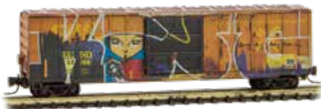
Z Railbox Series #10 'National Mischief Night' #510 45 014...$29.95