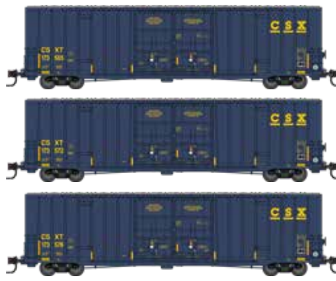
CSX® 3-pack #993 01 860...$119.95 Estimate mid-December