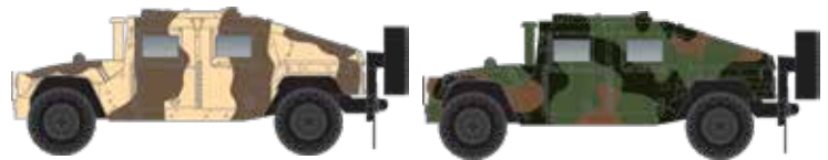
Desert Camo Humvee® Vehicle 2-pack #499 45 953...$34.95 Estimate January 2021