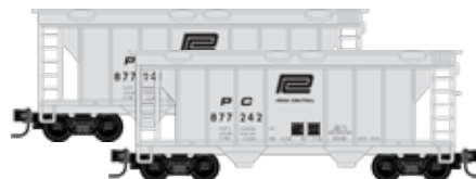
Penn Central #531 00 351....$25.95 • #531 00 352....$25.95