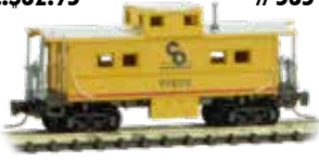
Chesapeake & Ohio® #535 00 460....$29.95