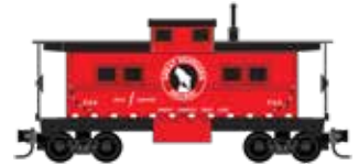
Great Northern #535 00 450....$29.95