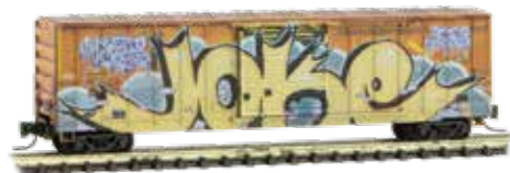
Z Railbox Series #8 'Tell a Joke Day' #510 45 013...$29.95