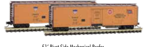
51' Rivet Side Mechanical Reefer American Refrigeration • Rd#284/268 Item#069 00 231...$29.90 • Item#069 00 232...$29.90