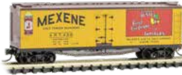
40' Double-Sheathed Wood Reefer Mexene/ART • Rd#426 Item#047 00 430...$27.95