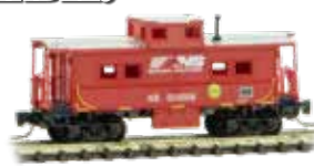
Norfolk Southern #535 00 440....$29.95