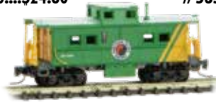
Northern Pacific #535 00 470....$32.95