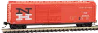
50' Standard Box Car, Double Doors New Haven • Rd#40509 Item#034 00 460...$26.90