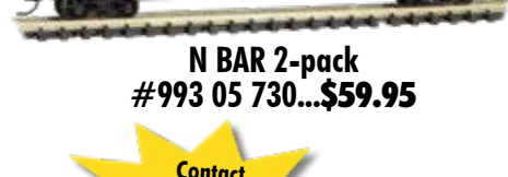
N BAR 2-pack #993 05 730...$59.95