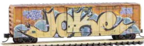
N Railbox Series #8 'Tell a Joke Day' #025 45 013...$29.95