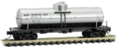
39' Single Dome Tank Car US Navy • Rd#T-102 Item#065 00 970...$27.90