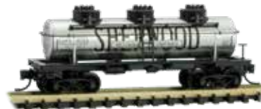
3-Dome Tank Car Sherwood • Rd#4453 Item#066 00 100...$29.95