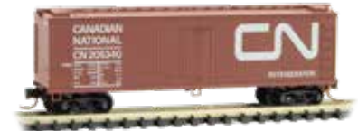
40' Double-Sheathed Wood Reefer Canadian National • Rd#205340 Item#047 00 160...$24.60