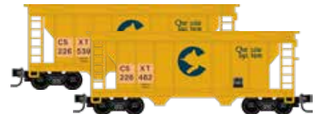
CSX® #531 00 331....$25.95 • #531 00 332....$25.95