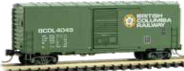
40' Standard Box Car, Single Door, Full Ladders, w/o Roofwalk British Columbia Rail • Rd#4049 Item#073 00 510...$24.80