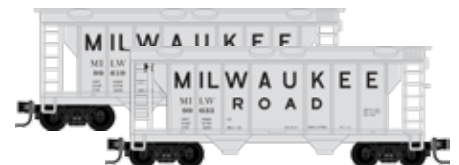
Milwaukee Road #531 00 361....$25.95 • #531 00 362....$25.95

*Renderings shown for representation only.