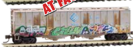
N ADM 3-pack #993 05 720...$109.95