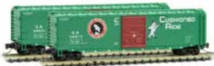
50' Standard Box Car, Single Door Great Northern • Rd#39651/39673 Item#505 00 401....$26.90 • Item#505 00 402....$26.90