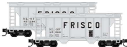
Frisco #531 00 341....$25.95 • #531 00 342....$25.95