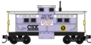
CSX® #535 00 420....$32.95