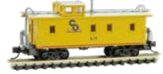
34' Wood Sheathed Caboose, w/ Straight Cupola Chesapeake & Ohio • Rd#A15 Item#051 00 330...$32.90