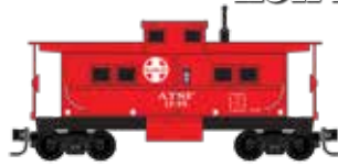
Atchison, Topeka & Santa Fe #535 00 430....$24.80