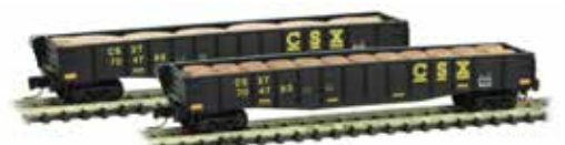
50' Gondola, Fishbelly Side, w/ Drop Ends CSX® • Rd#704786/704793 Item#522 00 241....$27.80 • Item#522 00 242....$27.80