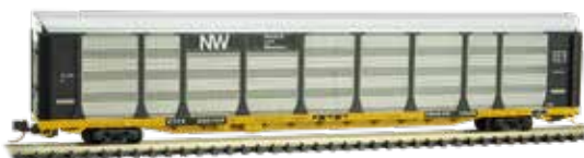
89' Tri-Level Closed Autorack Norfolk & Western • Rd#800795 Item#111 00 330...$51.90