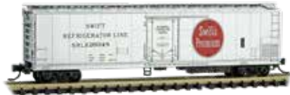
51' Rivet Side Mechanical Reefer Swift • Rd#25048 Item#069 00 240...$26.80