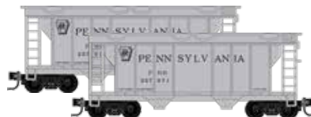
Pennsylvania #531 00 321....$25.95 • #531 00 322....$25.95