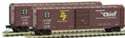
50' Standard Box Car, Single Door Atchison, Topeka & Santa Fe • Rd#11111/11129 Item#505 00 411....$26.90 • Item#505 00 412....$26.90