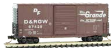
40' Hy-Cube Box Car, Single Door Denver & Rio Grande Western • Rd#67428 Item#101 00 031...$31.90