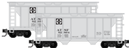
(Reprint) Atchison, Topeka & Santa Fe #531 00 073....$25.95 • #531 00 074....$25.95