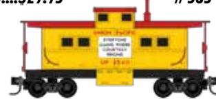
Union Pacific® #535 00 480....$29.95

Pre-orders were taken for this in March 2020