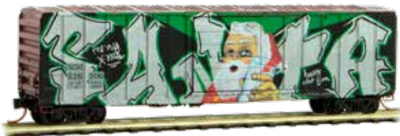
N Southern 'Santa' #025 44 330...$29.95