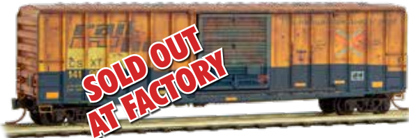
N CSX®/ex. Railbox #025 44 126...$28.95