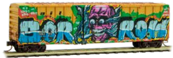
N Railbox 'Great Smokeout' #025 44 567...$28.95