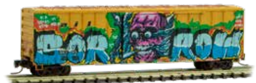
Z Railbox 'Great Smokeout' #510 44 228...$28.95