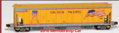
2016 Membership Car

The N Scale Enthusiast P.O. Box 30489 Savannah, GA 31410 www.NScaleEnthusiast.com