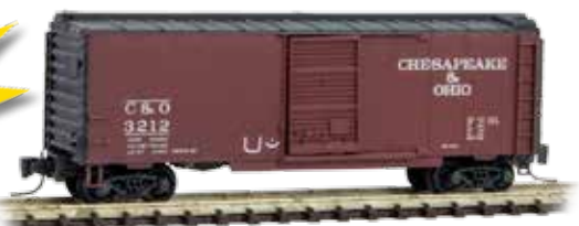
Z C&O® w/hobo tagging #500 44 760...$31.85

Contact Your Local Dealer for Availability!