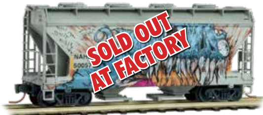
N NAHX 'Monster #1' #092 44 340...$32.90