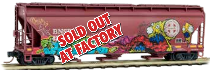
N BNSF 'Monster #2' #094 44 440...$33.90