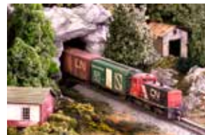
Last Year's Photo

e-mail your photo to mtl@micro-trains.com