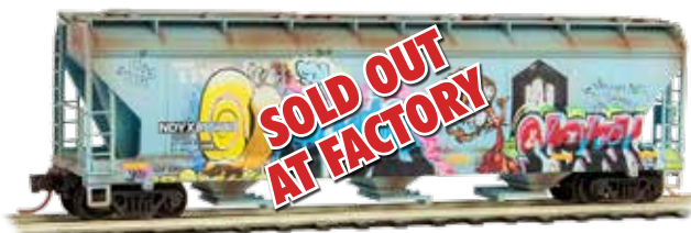
N NDYX 'Monster #3' #094 44 170...$33.90