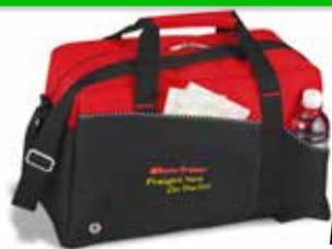
#995 30 015 MTL Duffle Bag... $24.95