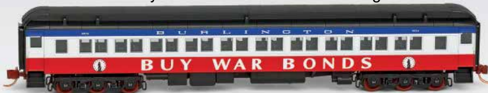
CB & Q "Buy War Bonds" Billboard Passenger Car